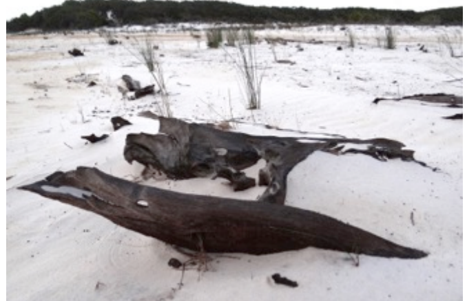
Lake Boomanjin has fallen to its lowest level in more than 50 years exposing more beach and driftwood

Afternoon tour was a revelation of the impact of the severe dry weather. Nearby Maryborough has record its driest year yet for 2016 but the extremely dry January and February are seeing a number of trees die in the bush. The most common of these was brush box and to a lesser extent Monotocca. However there are also a few scribbly gums and Banksia on the threshold of death or already dead.