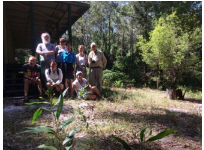
The Team at the Harold Charles Barracks, Lake Allom