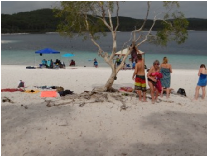
FIDO has established four Photo monitoring stations on the shores on Lake McKenzie (Boorangoora) to compare Lake levels, vegetation changes and usage over extended time. This is one of three sightings from Boorangoora 3