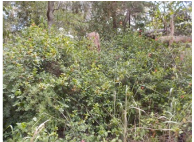
Coral Creeper Irrigated and enriched by treated effluent ran amok outside the dingo fence.