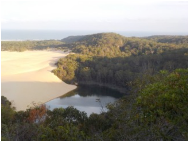
The quick walk to the Wabby Lakes lookout revealed a lake without people

Back in Eurong after a Happy (quarter) Hour at Coral Seas Suite 321 the group settled for diner at the resort restaurant. It would be the last night for half of the group. While it pleasant dinner where none of the group had to cook or wash up, the greatest joy was the thunderstorm that ended dinner. It was a tropical downpour that delivered 28 mm and left everyone feeling happy for the 200 plants we had established