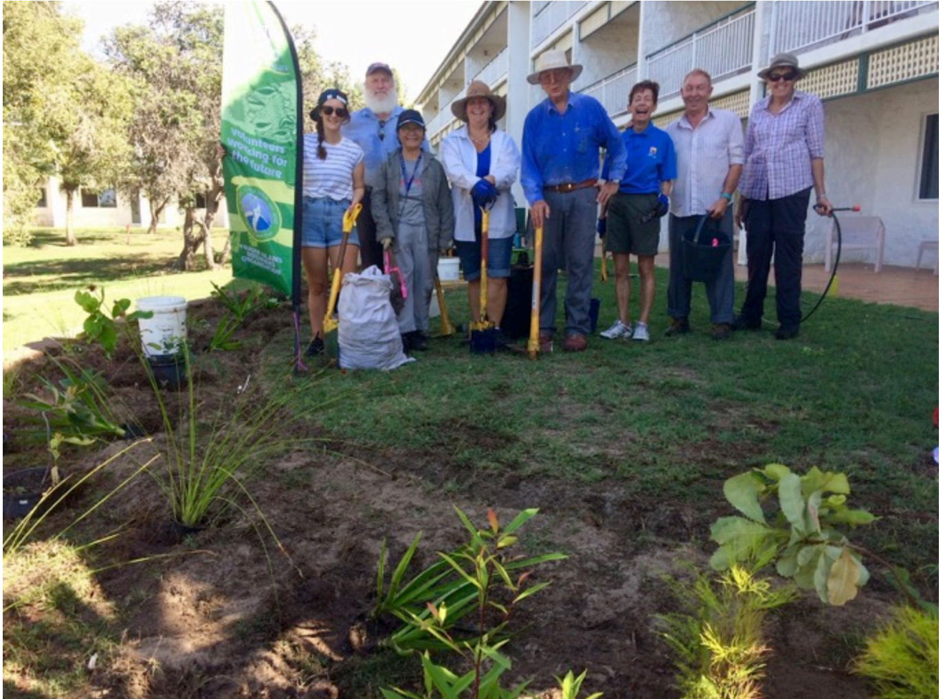
The team and a new garden changing the Eurong landscape