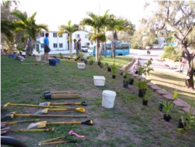
Laying out the garden before planting

All of the time holes were being dug for the 100 plants that had been laid out. This was thought not to be dense enough so more stock was gathered from the nursery bringing up to 120 plants altogether based on the number of pots. Suzanne advised that 18 species were planted in the new garden. Another seven species have been planted in other places nearby. It is already an impressive display because so much of the stock is already advanced.