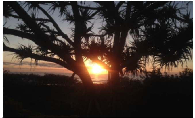
There was time for coffee at Elbow Point prior to catching the 6.30 am barge.

By mutual agreement the remaining quartet resolved to make a very early start departing at 5:30 am.