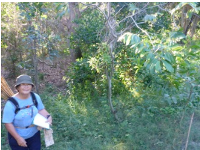
Su checking out and marking weed infestations to return to later.