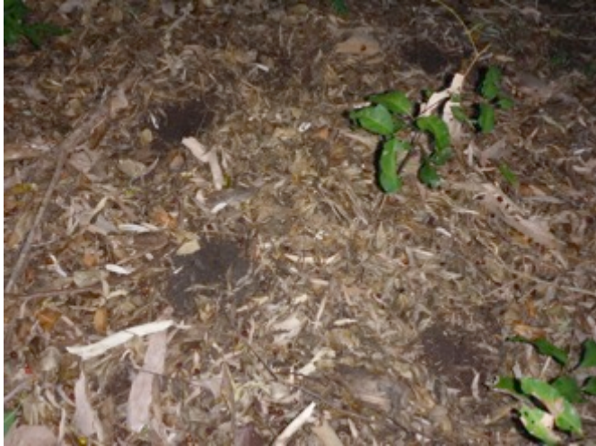
Black Breasted Button Quail platelettes