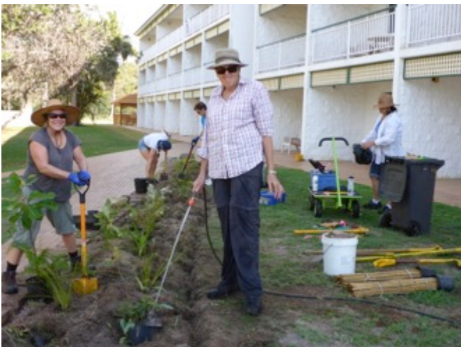
Once work began everyone was fully engaged

All of the time someone was watering the holes and soaking the sand to overcome the water repellence resulting from the extremely dry conditions. Only then after all of these preliminary preparations been done and did the actual the planting begin.